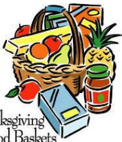
Thanksgiving Food Baskets